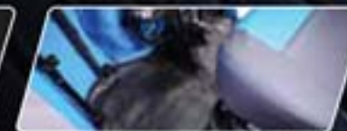
Seat Cover Set