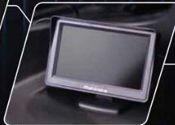
Reverse View Camera Kit