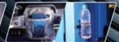
Utility Pouch & Bottle