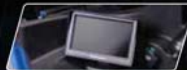
Reverse View Camera Kit