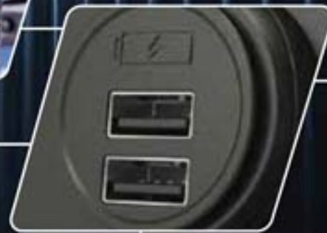
Dual USB Charger Socket